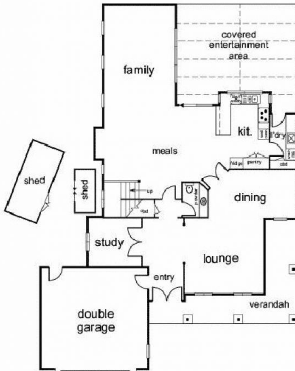
16 Connaught Place, Glen Waverley